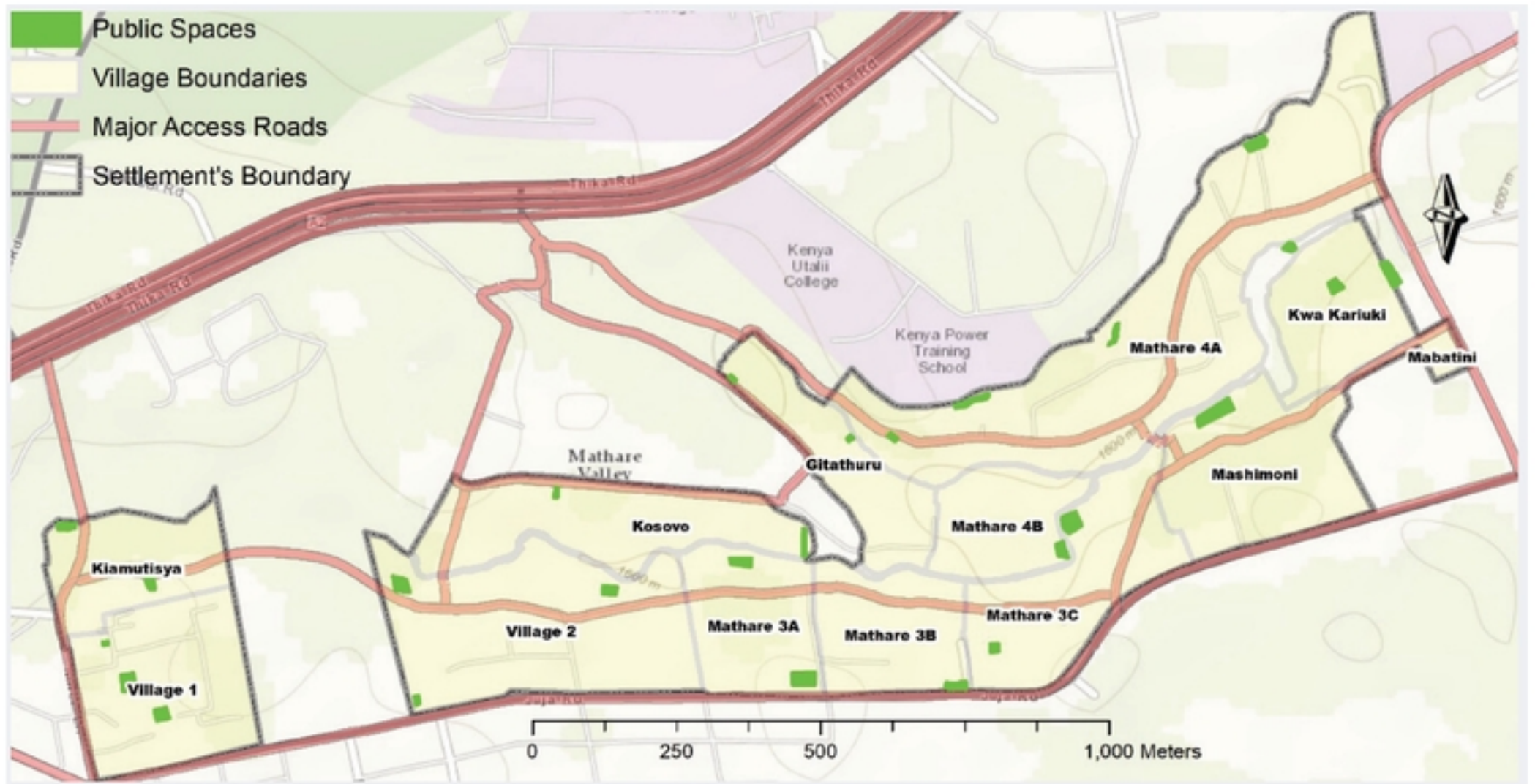
Fig. 3 Map of Mathare urban informal settlement