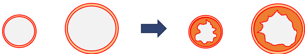
Figure 3: Schematic diagram of the stenosis contrast between large and small conduits

Assuming that two different size conduits are exposure to the same degree inflammatory stimulation and become stenosis, the large conduit still has more inner-space than the small one, therefore the conduit velocity change is not obviously.