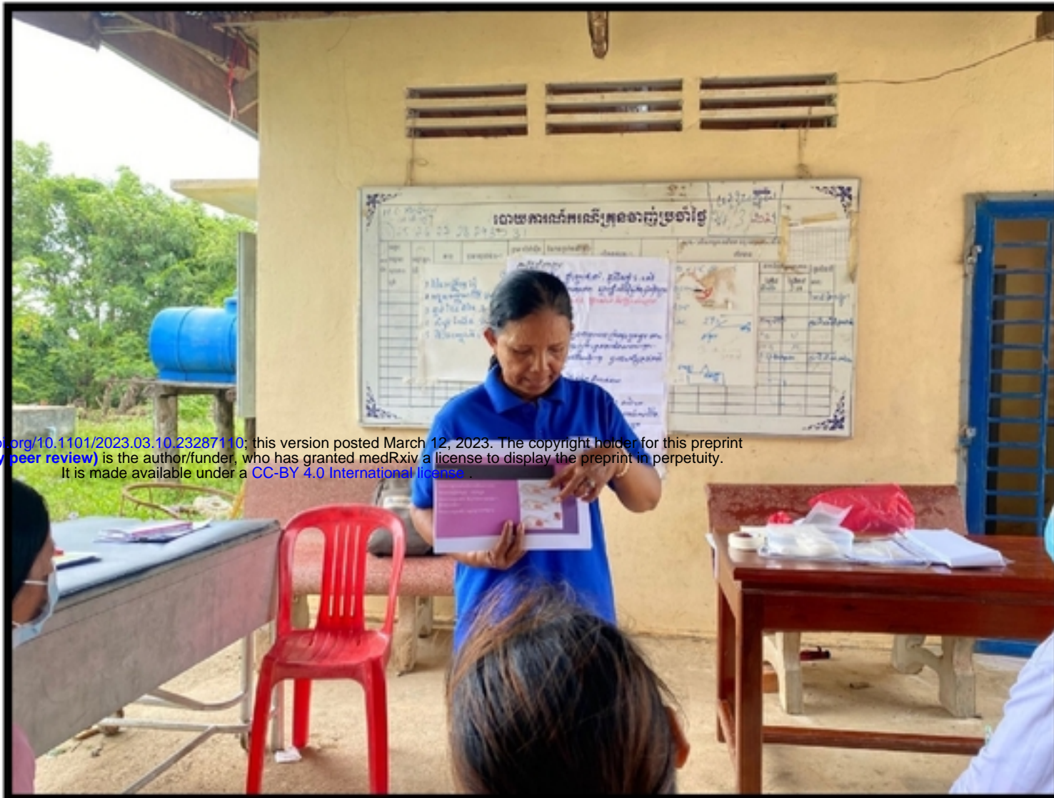
Figure 2. Health education training.

medRxiv preprint doi: https://doi.org/10.1101/2023.03.10.23287110 ; this version posted March 12, 2023. The copyright holder for this preprint (which was not certified by peer review) is the author/funder, who has granted medRxiv a license to display the preprint in perpetuity. It is made available under a CC-BY 4.0 International license .