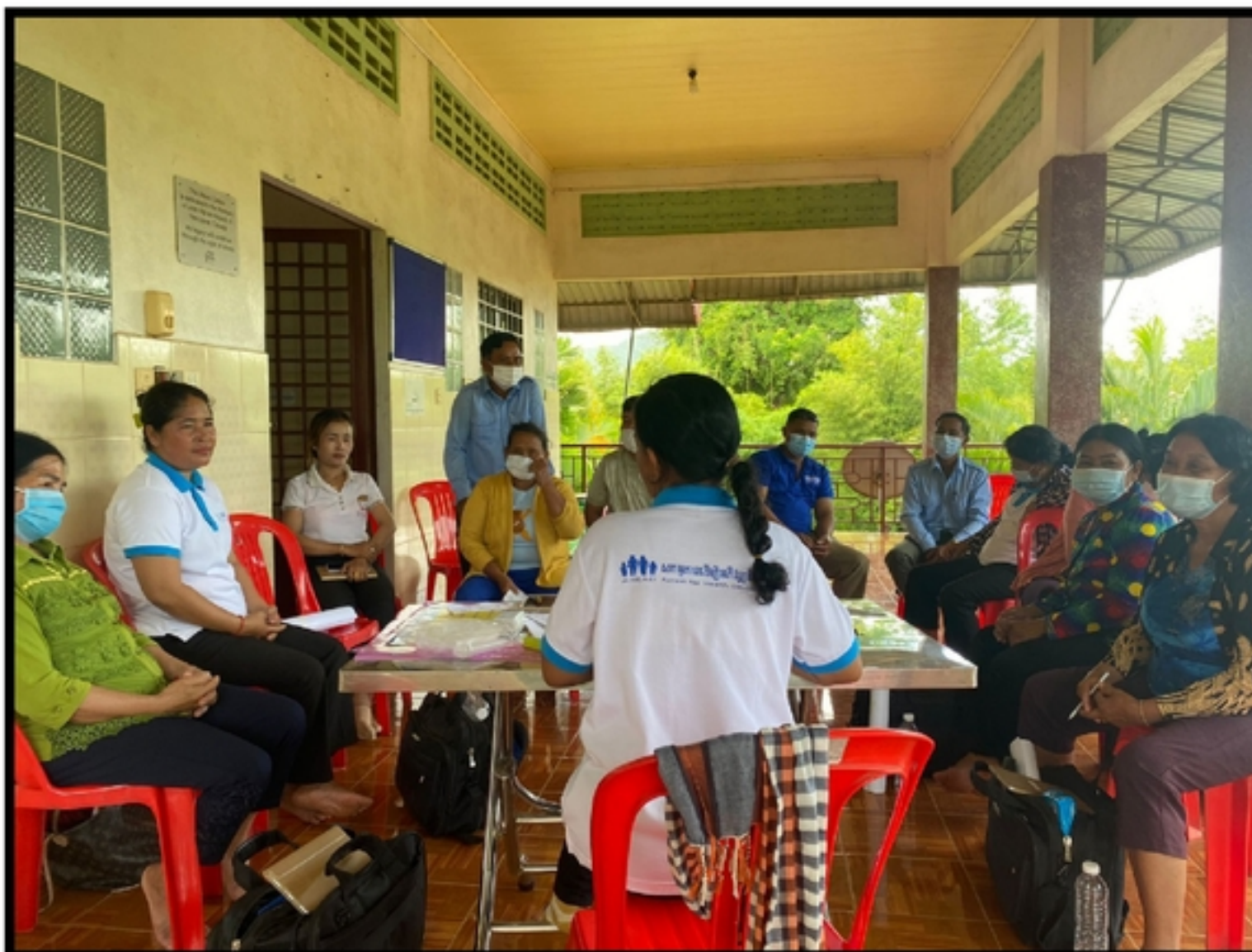
Figure 3. Focus Group Discussion.

medRxiv preprint doi: https://doi.org/10.1101/2023.03.10.23287110 ; this version posted March 12, 2023. The copyright holder for this preprint (which was not certified by peer review) is the author/funder, who has granted medRxiv a license to display the preprint in perpetuity. It is made available under a CC-BY 4.0 International license .