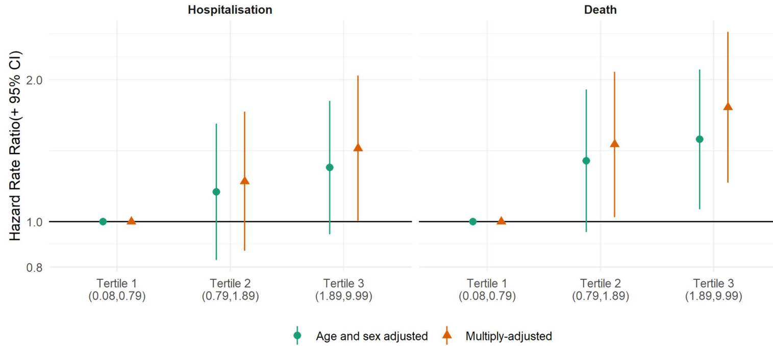
Supplemental figure 1. Association of C-reactive protein (2006-2010) with ALS risk (2010-2020) in UK Biobank (N=400,884)