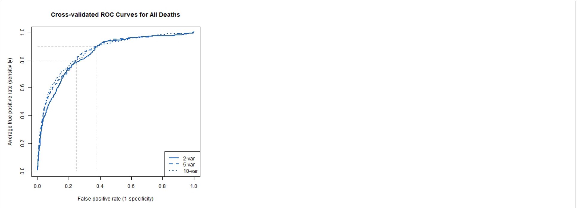
Figure 1: ROC curves: Average ROC curves from the cross-validated logistic regression models predicting growth faltering and death with 2, 5, and 10 predictors. The faded dashed lines represent examples of specificities (1- false positive rate) that could be achieved with a sensitivity (true positive rate) of 0.80 for prediction of each outcome.