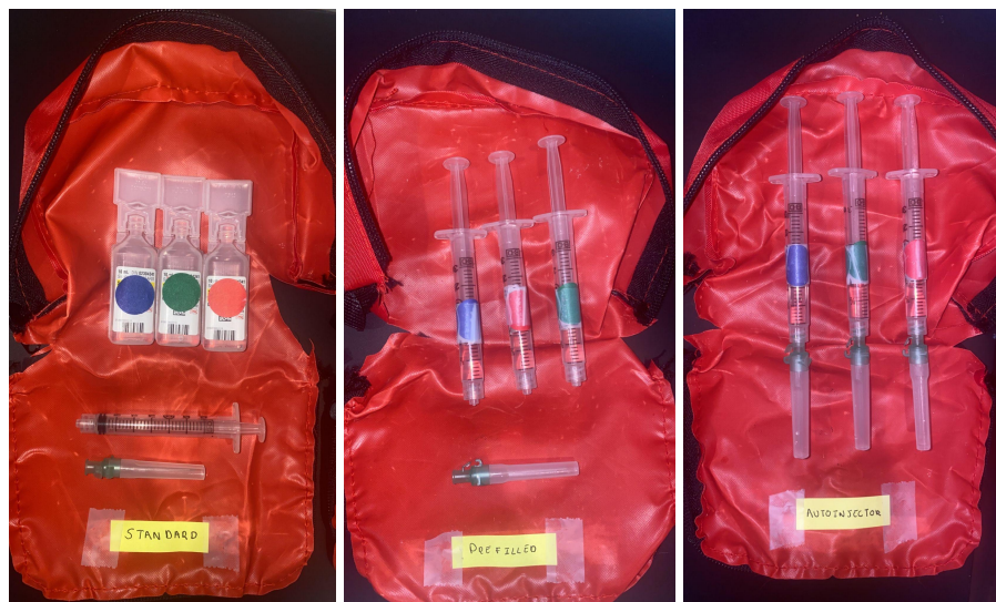
Figure 1: The Three Methods of Injection (i.e. Standard, Prefilled and Autoinjector)

For each scenario participants were asked to inject the “medication” using three methods represented in Figure 1: 1) standard protocol, 2) autoinjector, and 3) prefilled syringes. For each scenario, the appropriate medication administration type was selected amongst groups of options based on the given instructions and scenario: 1) autoinjector equivalents (i.e. medication, needle and syringe attached); 2) prefilled syringes (i.e. a needle is attached by the participant prior to administration); and 3) standard protocol (i.e. drawing medication from the vial and injecting via syringe and needle). Medication administration scenarios were for either 1) Naloxone (opioid overdose), 2) Epinephrine (anaphylaxis), or 3) Tranexamic acid (bleeding). A 21-gauge 1.5-inch needle was used for drawing up the medication and for injection.