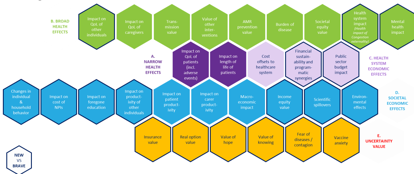
Figure 3 Visualised Vaccine Value Framework