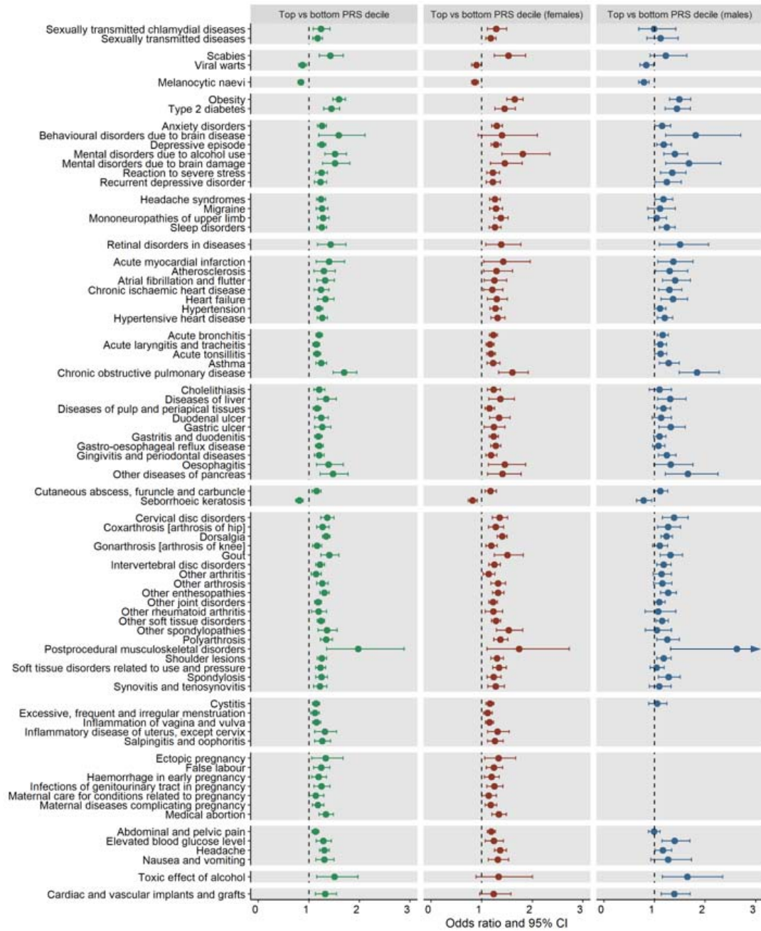
Figure 3. Comparison of associations between high PRS ADHD risk and ICD-10 codes in females and males.

Note: PRS – polygenic risk score; 95% CI – 95% confidence intervals; ICD-10 codes less than 10 cases were excluded from analyses