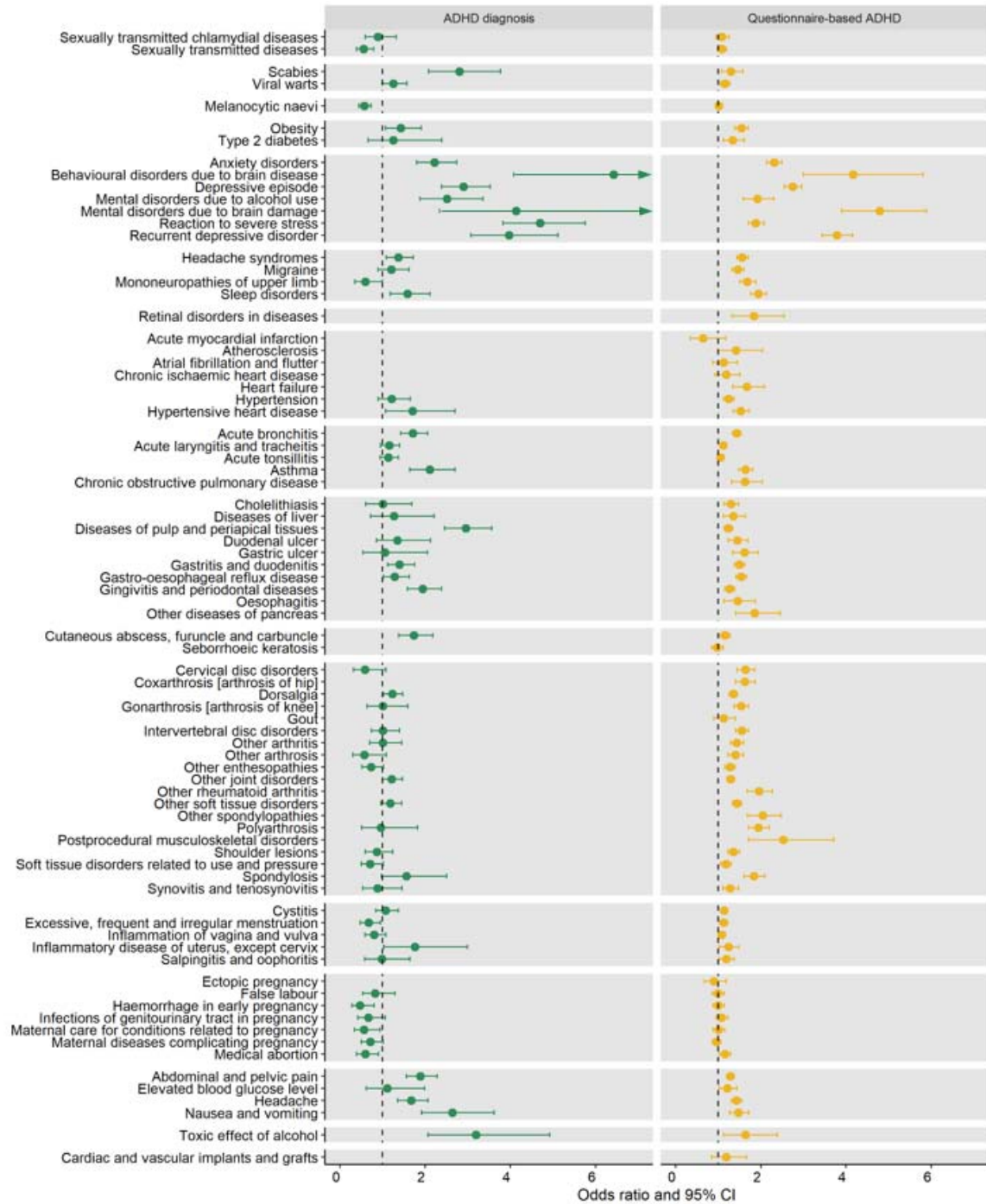
Figure 4. Comparison of associations between ADHD diagnosis and questionnaire-based ADHD on ICD-10 codes after adjustment for multiple testing.

Note: PRS – polygenic risk score; 95% CI – 95% confidence intervals; ICD-10 codes less than 10 cases were excluded from analyses