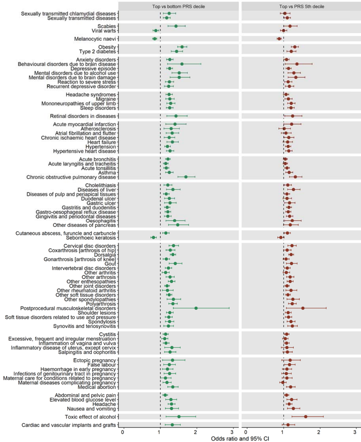
Figure 2. Comparison of associations between top vs bottom and top vs medium PRS ADHD risk on ICD-10 codes after adjustment for multiple testing.

Note: PRS – polygenic risk score; 95% CI – 95% confidence intervals;