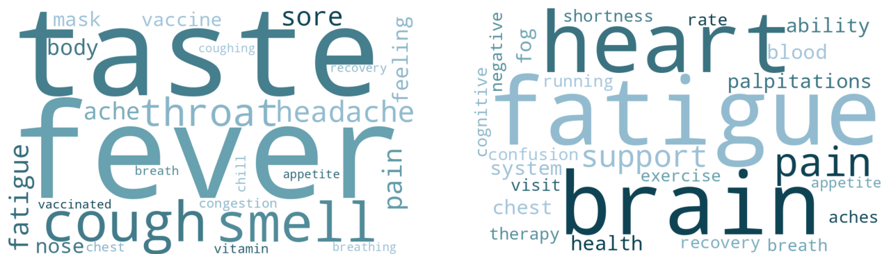
Figure 2: Interpretation of results from LLM-driven COVID and Long COVID detection. Left: keywords from non-omicron predictions. Right: keywords from Omicron predictions.

Fig. 2 presents the visualization of relevant terms in the task of detecting general COVID-19 cases and Long COVID-19, showing the transition from common symptoms such as fever or loss of taste (Fig. 2 - left) to cognitive and/or cardiovascular effects (Fig. 2 - right)., consistent with existing scientific literature. 36