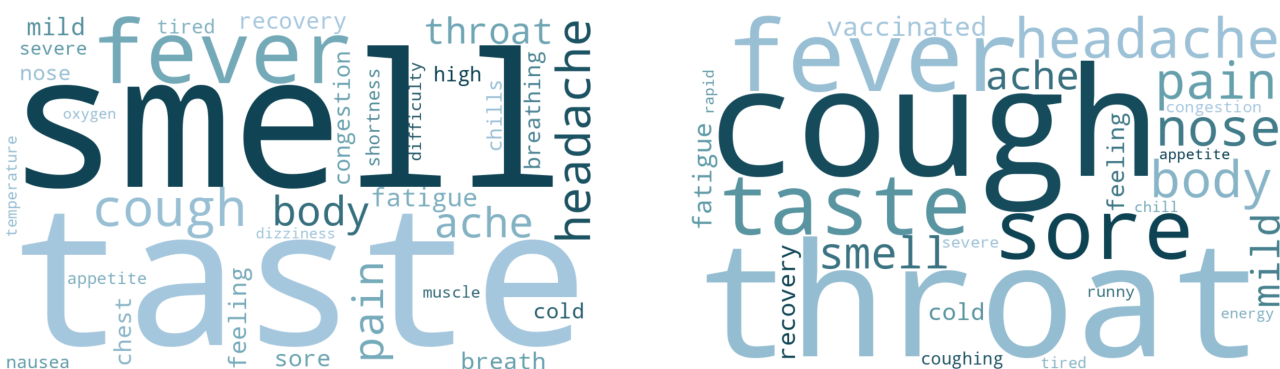
Figure 3: Interpretation of results from LLM-driven variant classification. Left: keywords from non-Omicron prediction. Right: keywords from Omicron prediction.

Figure 3 displays the interpretation of results for the variant classification task. In Fig. 3 (left), results show that LLM decision-making emphasized symptoms such as the loss of taste and smell, which aligns with large-scale studies (e.g., Menna et al.). 37 Compared to the non-Omicron cases (Fig. 3 - left), the keywords from Omicron predictions shown in Fig. 3 (right) significantly emphasized upper respiratory symptoms – “sore throat” and “cough” – which were found to be associated with the Omicron variant. Other keywords such as “mild” and “vaccinated” (indicating a breakthrough case) also match with past studies. 38