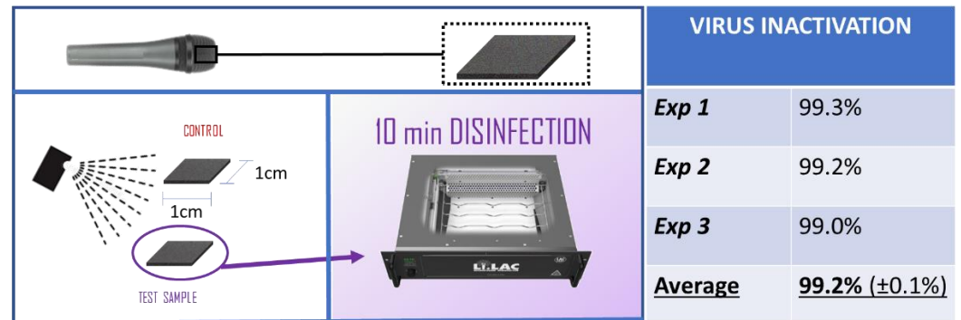
Figure 3. Representation of the spray deposition of virus onto a foam from the inside of the microphone, and representative results from disinfection experiments.

For the inoculated foam samples, the viruses were extracted and the viral loads of the disinfected sample and the respective control were compared to assess the reduction of PFU in percentage. Figure 3 shows reductions in the M13 titers of 99.3, 99.2, and 99.0% in the technical replicates. On average it was found that a 99.2% reduction in the viral titer was achieved by 10 min of UV-C irradiation. We regard this as an important finding, because the foam is considered to be the most inaccessible part of the microphone that may shield micro-organisms against UV-C due to its porosity. The efficacy of UV-C disinfection for 20 min was only marginally increased compared to disinfection for 10 min and, therefore, all further experiments involved 10 min UV-C disinfection.