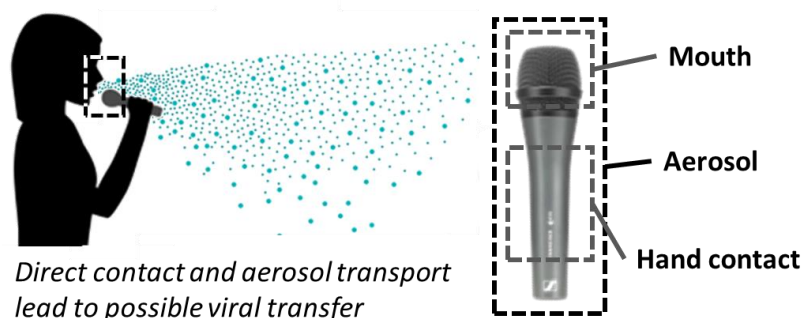
Figure 1. Representation of possible aerosol production during sound emission, and possible microbial contamination of different parts of a microphone, which may lead to the transmission of pathogens upon shared use of the same device by different individuals.