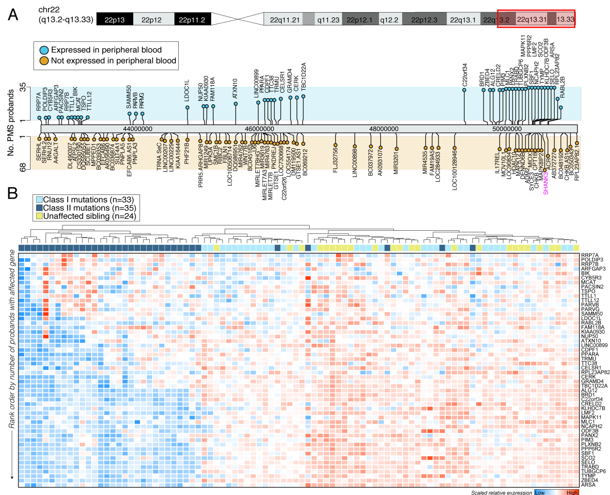
Figure 1. The landscape of Class I and Class II mutations in PMS. (A) Lollipop plot of genes affected by Class I mutations and Class II mutations across the terminal end of the long arm of chromosome 22 (22q13.3) in the 68 PMS probands included in the study. Genes are displayed as either expressed (blue; n=52 genes) in peripheral blood or not (orange; n=76 genes) and ranked by the number of probands harboring the affected gene (y-axis). SHANK3 is highlighted in pink. (B) Unsupervised hierarchical clustering and heatmap (blue=low; red=high) depiction of the 52 genes on 22q13.3 that are expressed in peripheral blood affected by Class I and Class II mutations. Clustering distinguishes probands with Class II mutations from those with Class I mutations and unaffected controls. Genes were rank ordered by the number of PMS participants with the affected gene (y-axis; rare to more frequent).