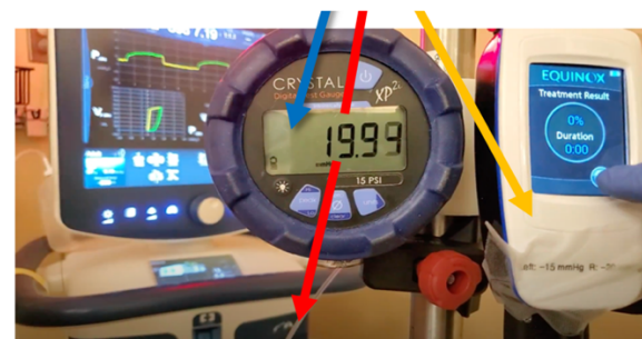
FIGURE 1. Layout of the testing set up. Top left: view of the multi-pressure dial (MPD) and air-tight goggles. Top right: view of infusion line tube passing through air-tight goggles and inserting via an anterior chamber maintainer inside the anterior chamber of the donor's eye. Bottom: view of the pressure gauge manometer for measuring intraocular pressure, and of the MPD negative pressure pump.

In-flow line connecting the digital pressure gauge with the anterior chamber maintainer inserted into the cornea