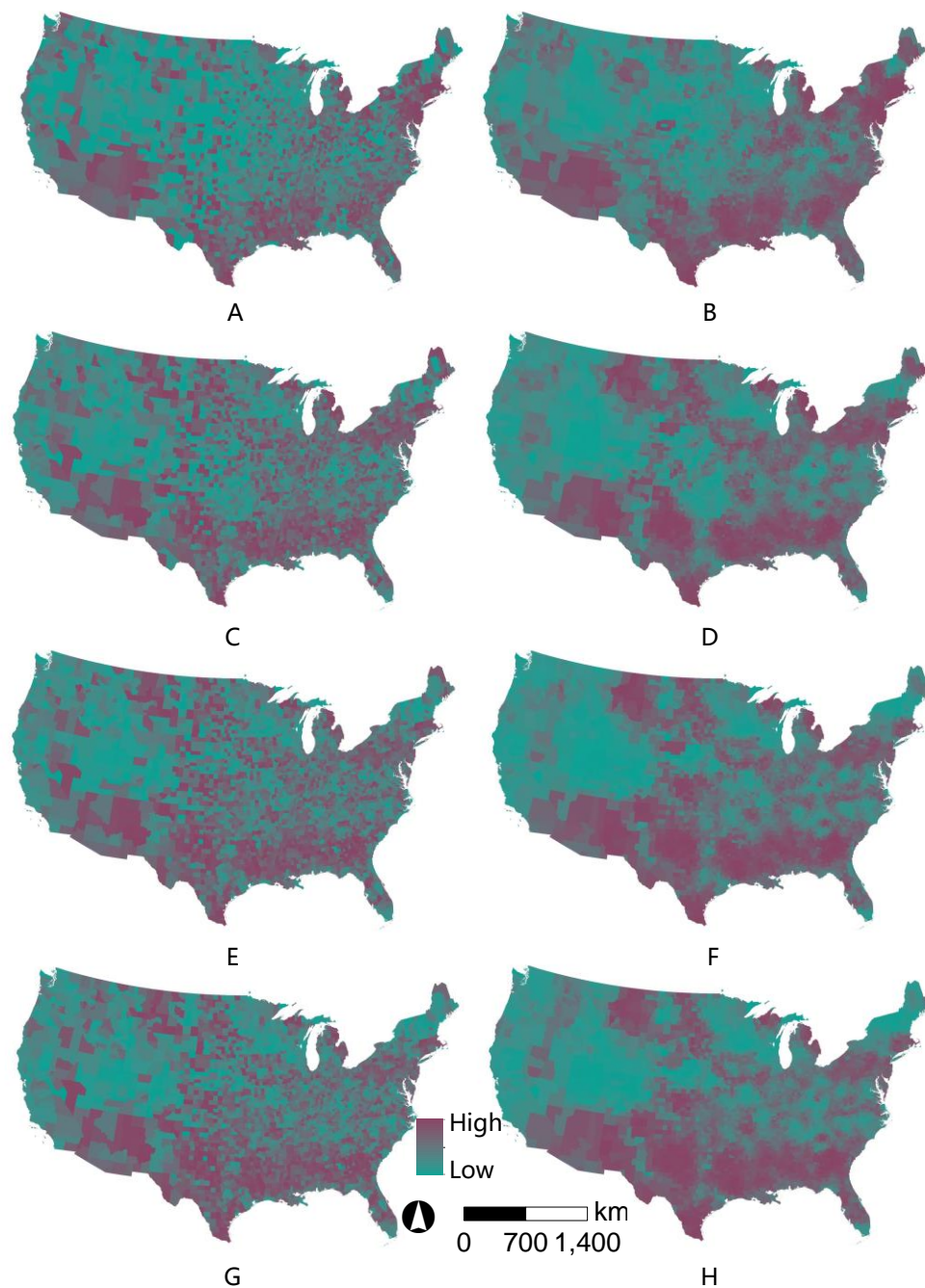
Figure 1. County-level COVID-19 fatality across the contiguous US

Note: The figures on the left side from A to G show the distribution of fatality for period 1, period 2, period 3, and period 4, respectively. The corresponding right figures from B to H show the distribution of spatially lagged fatality for the corresponding time periods.