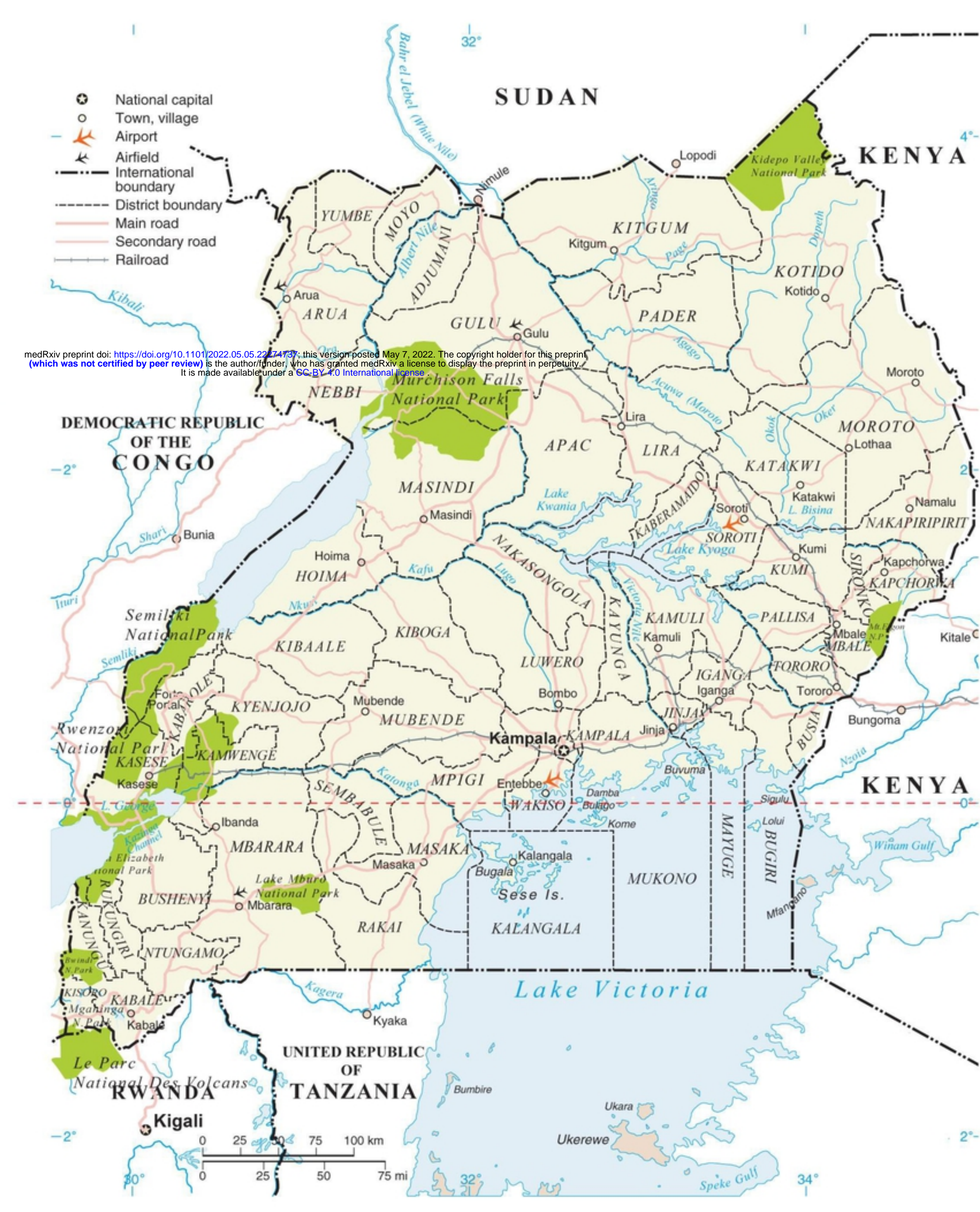
Figure1: Map of Uganda showing study area