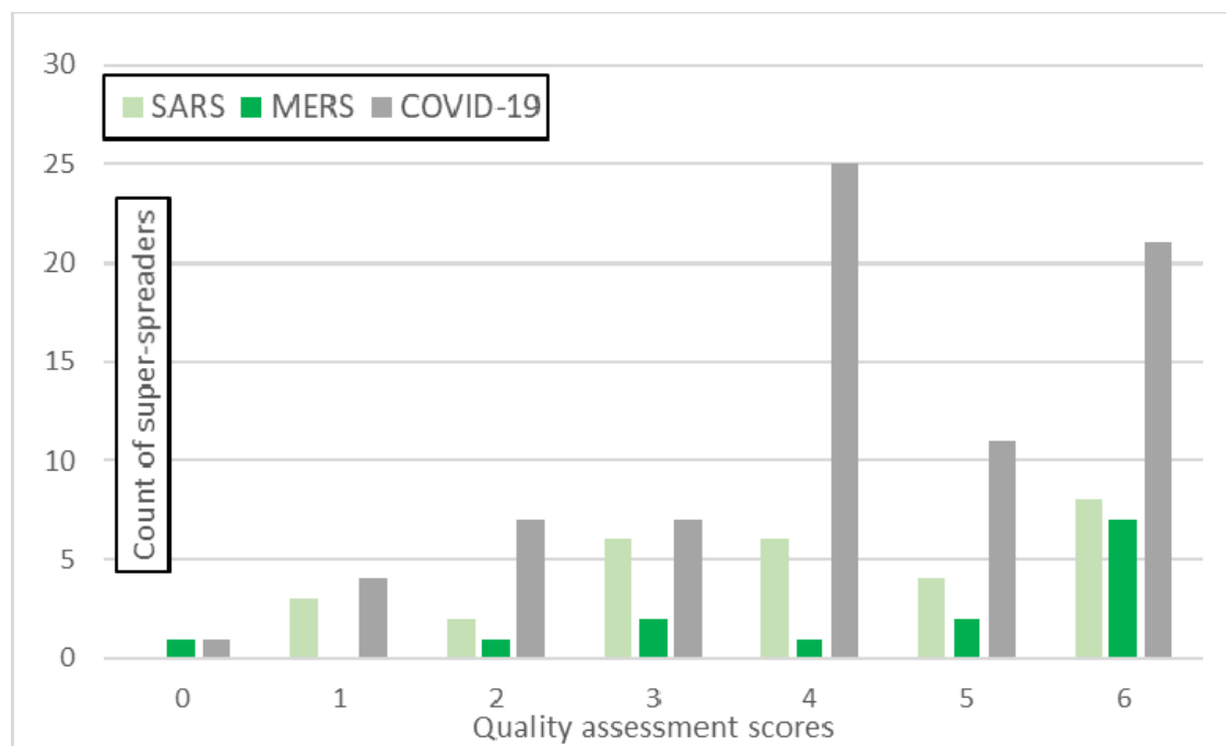
Figure 2. Quality assessment scores for epidemiologic information on nCoV super-spreaders.

Altogether, 30% (36/119) of super-spreader individuals had epidemiologic descriptions that as a group, scored 6 in the quality assessment exercise (most credible rating). Proportionately, MERS super-spreaders had the highest number of “most credible” ratings (7/14 (50%)). Altogether, 28% (8/29) of SARS super-spreaders had epidemiologic evidence that was most credible, this figure was similar for COVID-19 super-spreaders (26% (21/76)). Figure 2 gives more detail about the distribution of quality scores for the individuals identified.