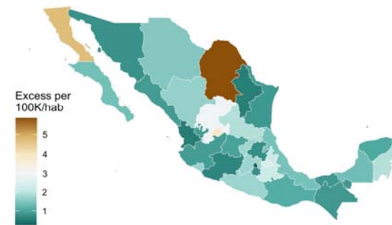
Figure 3. Choropleth maps showing the distribution of estimated age-adjusted diabetes-related excess mortality in Mexico during 2020 compared to 2017-2019, overall (A) and stratified by type 2 (B), and type 1 diabetes (C), according to ICD-10 criteria. Distribution of all evaluated measures was estimated using the quantile method with the biscale R package.

Age-adjusted excess mortality in type 1 diabetes