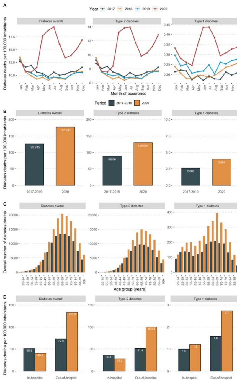
Figure 1. Monthly trends over time of diabetes-related deaths per 100,000 inhabitants during the 2017-2020 period and stratified for overall, type 1 and type 2 diabetes classified using ICD-10 criteria (A). We also show a comparison of diabetes-related deaths between the average of 2017-2019 and 2020 by diabetes type (B), by age group per 5-year increments (C) and stratified according to out-of-hospital vs. in-hospital mortality (C).