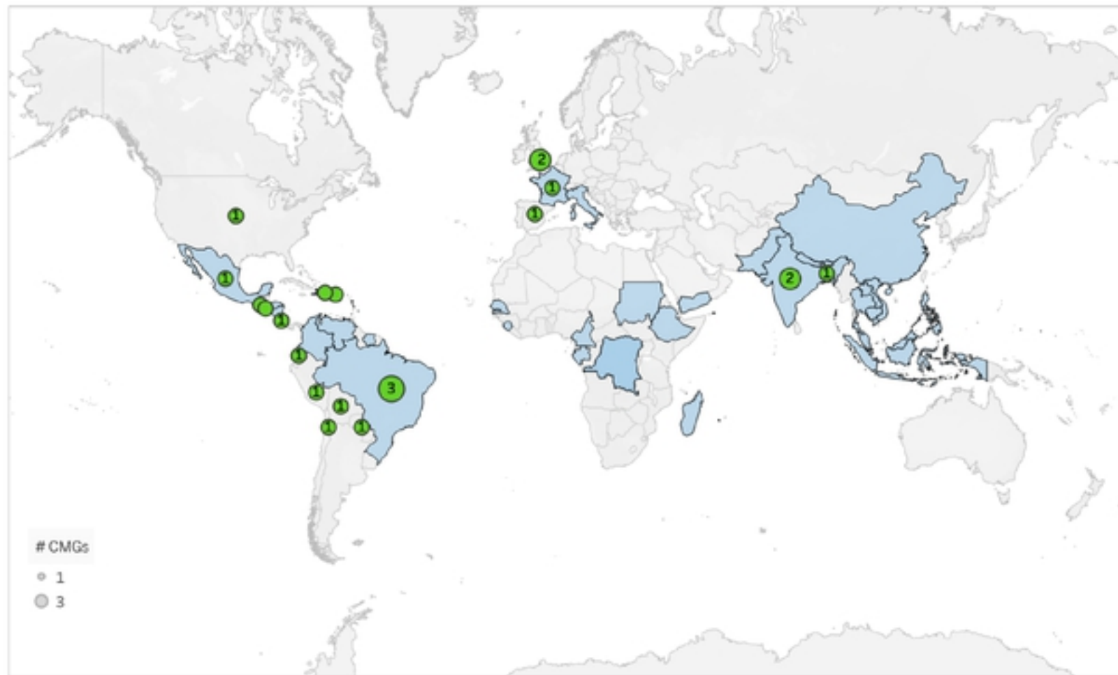
Figure 2: Chikungunya outbreaks (1999-2020) and geographic distribution of identified CMGs

The blue shading shows human Chikungunya outbreaks documented as of 1999-2020. 56 The green dots represent countries with a chikungunya clinical management guidelines (CMGs) and the numbers identified. Additionally, there were three global CMGs produced by the World Health Organisation (WHO), Medscape and Up-to-date, and three regional CMGs produced by the Pan-American Health Organisation (PAHO), WHO