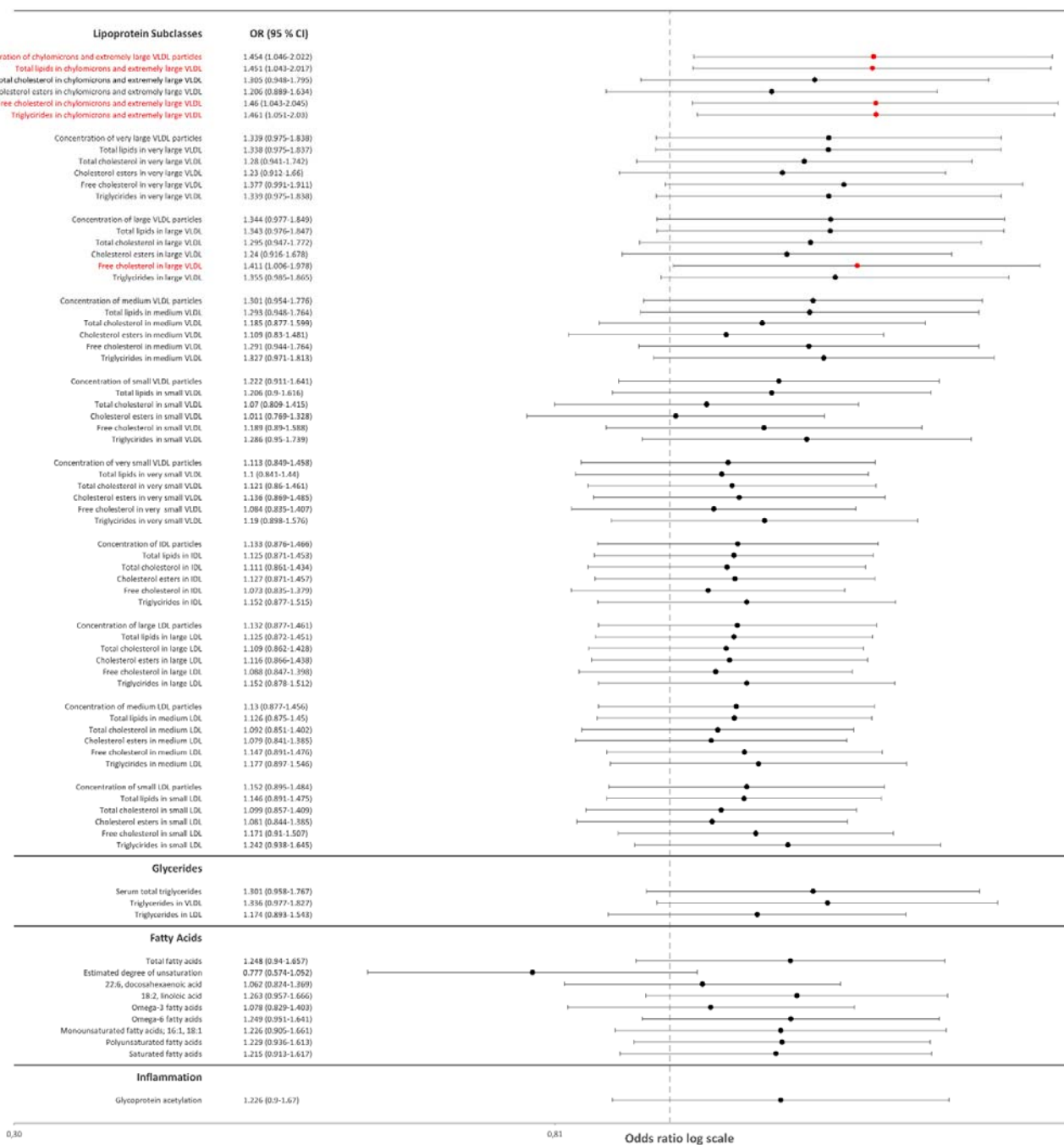
Figure 2 Results of the conditional logistic regression analysis of the 73 metabolic markers. The measures highlighted in red were statistically significant in the univariate analysis but not after correction of multiple testing.