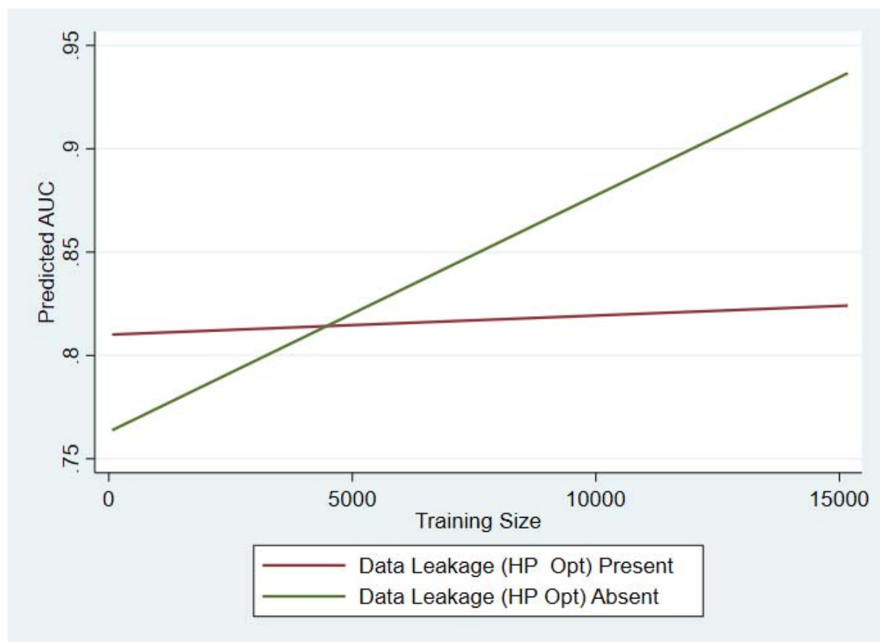
Figure 2. Predictive Margins Analysis of Data Leakage Due to Hyperparameter Optimization. Here, we graph the linear fit of the predicted AUC when we fixed data leakage due to hyperparameter optimization to either absent or present. The average marginal effect of training size on AUC was nominally significantly positive ( p = 0.004 ) when