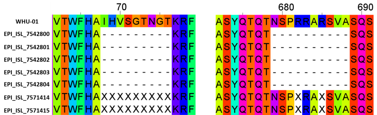
Figure 1: Portion of spike glycoprotein sequence alignment of seven isolates with Wuhan-01 as reference sequence. A 9 amino acid deletion was observed spanning the 68-76 amino acid long region (left panel) while a 10 amino acid deletion was observed spanning the 679-688 amino acid region (right panel).