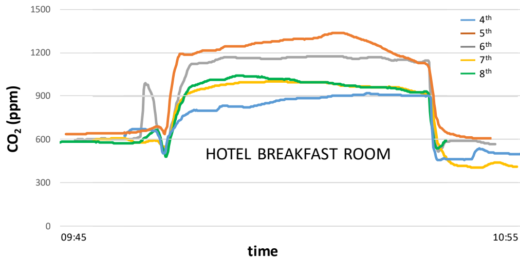
Figure 1: CO 2 concentration curves for hotel breakfast periods on the five days 4 th -8 th December 2021. The curves record initial hotel room conditions (600-650ppm) interrupted by a brief trough marking a short outdoor walk to the breakfast room inside which CO 2 levels rose steeply, especially on the 5 th (Day 2 on Table 1) when the room was fully occupied. The pre-breakfast transient peak on the 6 th records entry into the hotel bar area. See text for details.