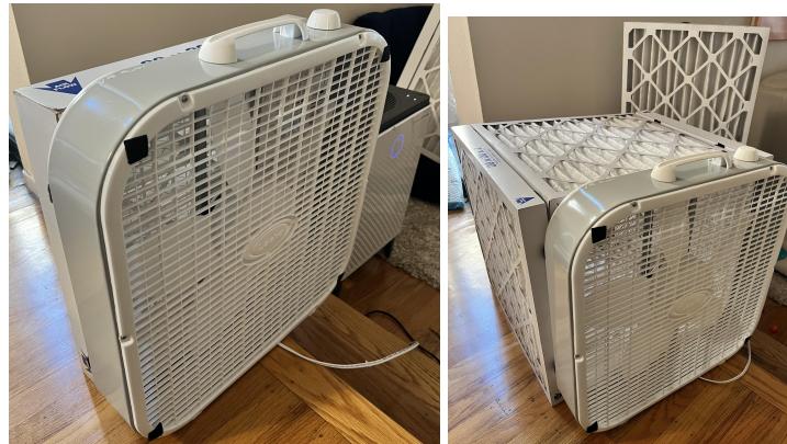
DIY box-fan filters with single and quad filter designs

clean air delivery rate (CADR) are unaffordable for many communities, how else can they achieve target ACH while addressing [10] [11] both cost and noise generation concerns?