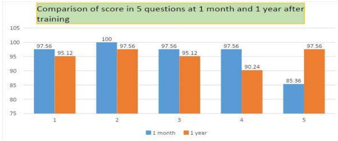
Figure 1: Comparative scores at one month and 12 months follow up