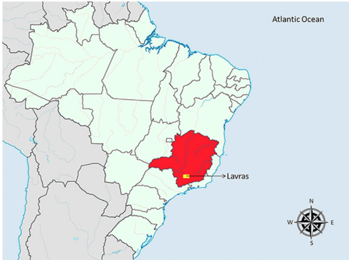
Figure 1 - Location of the municipality of Lavras, Minas Gerais, Brazil.