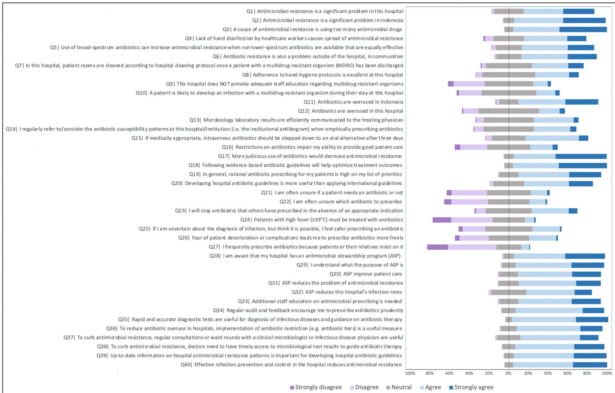
Figure 1. Five-point Likert scale responses for the 40-item questionnaire

Acronyms: ASP, antibiotic stewardship program. Data (n, %) are summarized in Table S3.