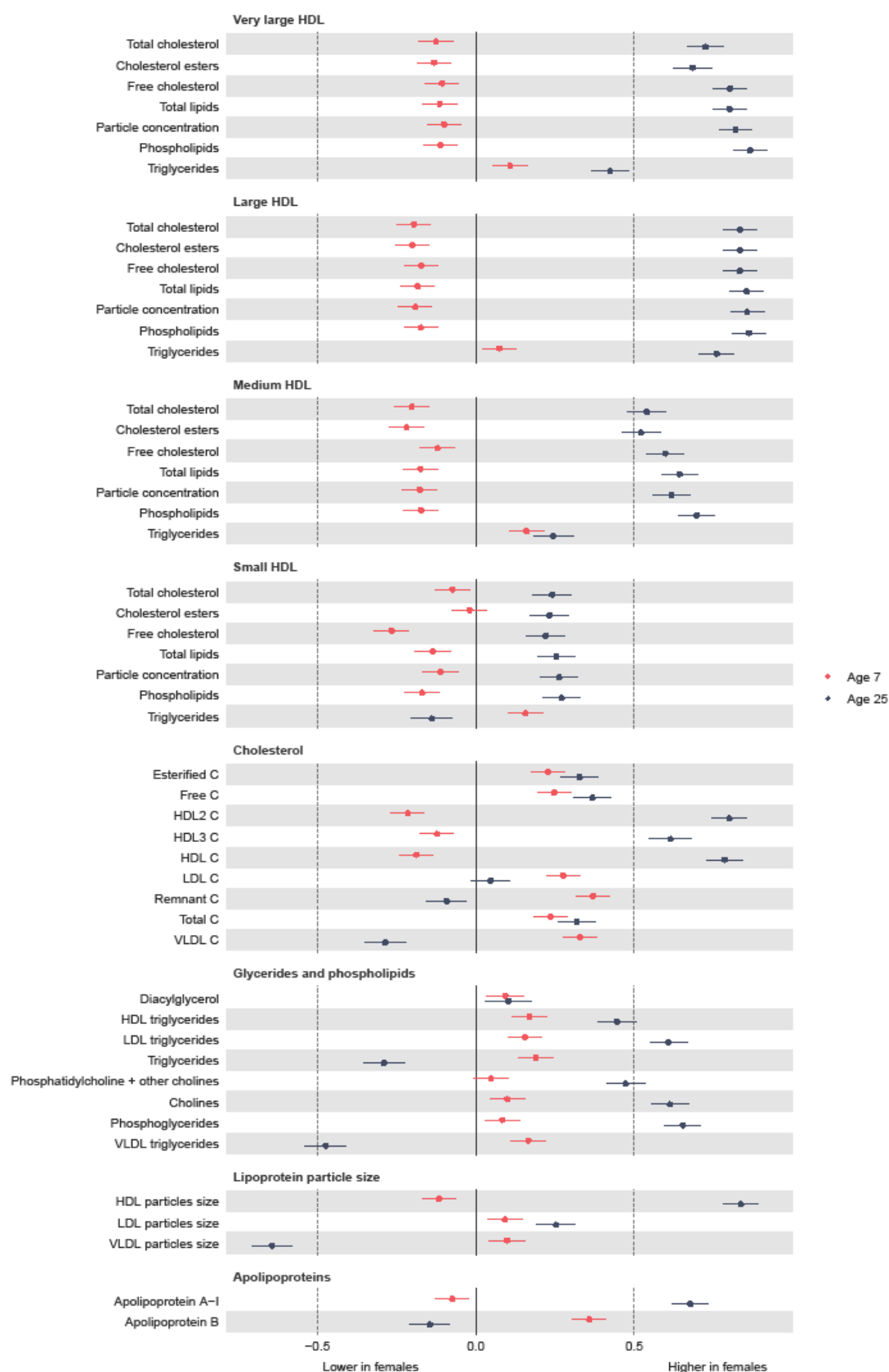
Figure 2 Mean sex difference in lipid in SD units at 7y and 25y, estimated from multilevel models. Legend: HDL, high-density lipoprotein; LDL, low-density lipoprotein; VLDL, very-low-density lipoprotein. Note that diacylglycerol is only measured up to 18y.