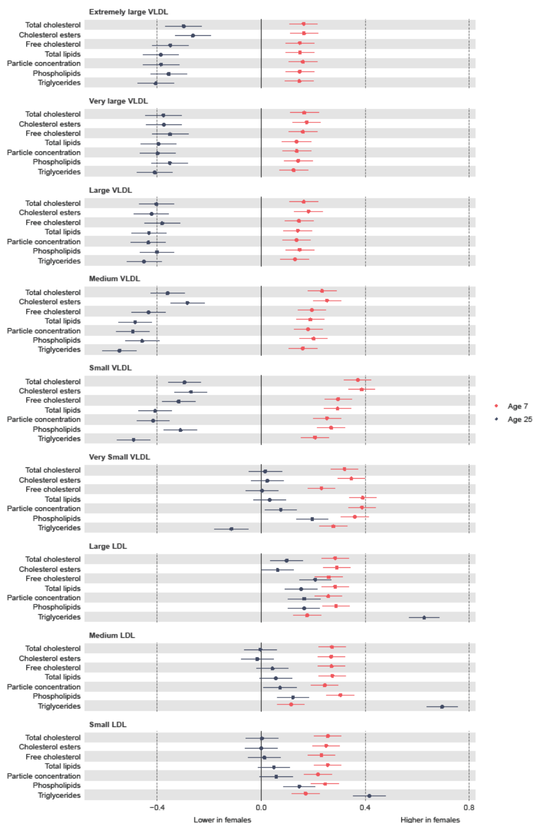
Figure 1 Mean sex difference in VLDL and LDL lipoprotein concentrations in SD units at 7y and 25y, estimated from multilevel models. Legend: LDL, low-density lipoprotein; VLDL, very-low-density lipoprotein.