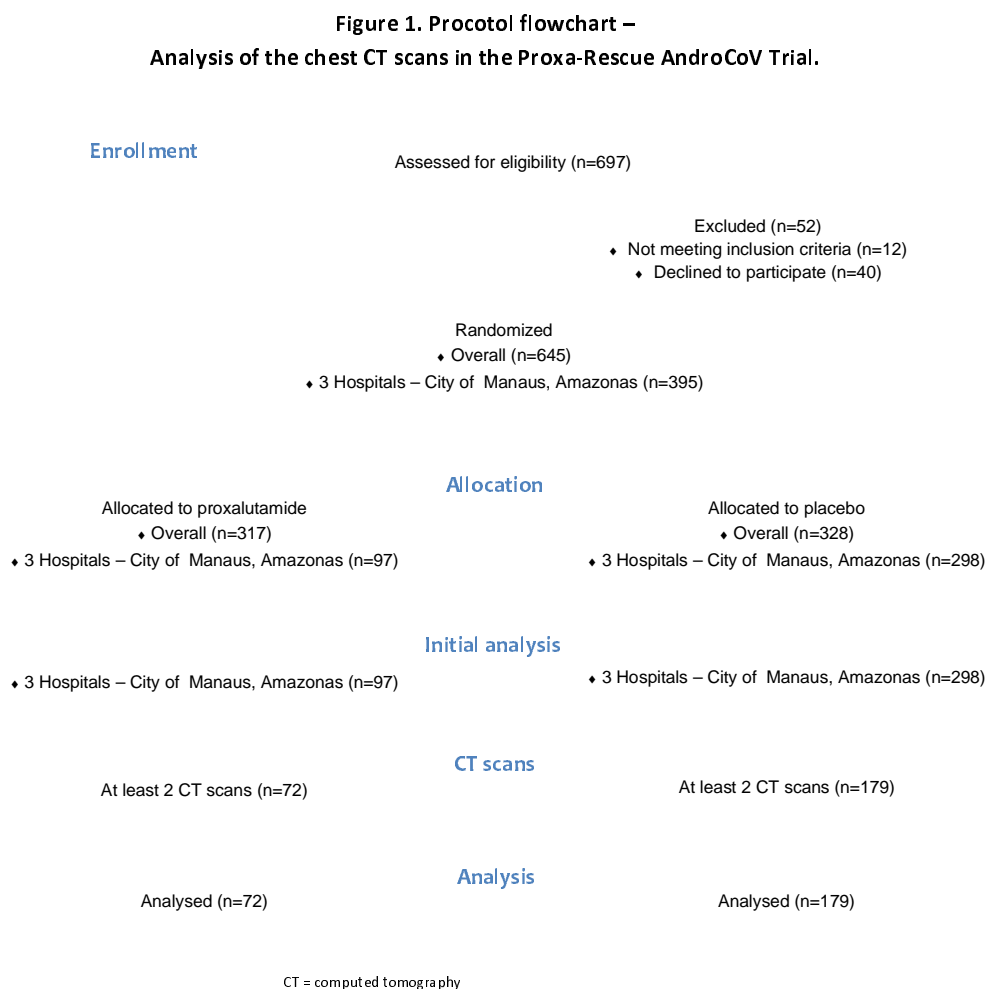
Figure 1. Protocol flowchart.

The flowchart depicting the subject selection in the proposed protocol is shown in Figure 1. A total of 395 patients were initially evaluated, including 97 patients in the active arm and 298 patients in the placebo arm, which corresponds to all patients enrolled in the three hospitals from Manaus, Amazonas, Brazil. Imbalances between sites in terms of active and placebo proportions are explained elsewhere. 11 Of these, 72 patients from the proxalutamide arm and 179 patients from the placebo arm had at least two chest CT scans, and were included in the present analysis.