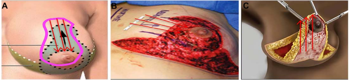
Fig. 2: The Pedicles. A. Superior pedicle mammoplasty, B. Superomedial pedicle mammoplasty, C. Inferior pedicle mammoplasty.