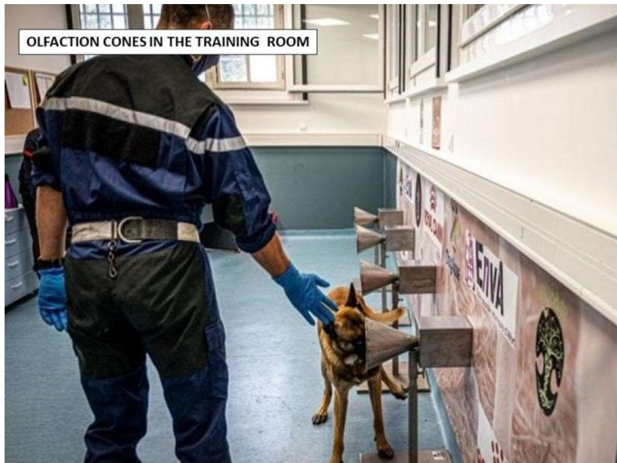
Figure 1. Line-up of olfaction cones in the training room