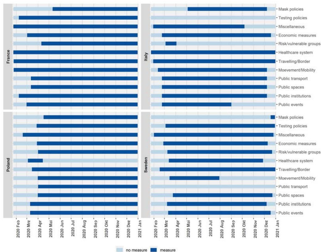
Figure 1. Example of bar graph used to describe data gathered to guide the Quality Assessment of COV-PPM.

The qualitative component of the QA procedure consisted in analysing the numerical coding and comments/textual elements saved for about 5-10% (around 2 weeks) of the total time sequence of each NPI, for each country, German federal state, and districts. The selection of the proportion of time to examine was based on the amount of comments/textual information registered (sequences with more frequent elements were selected but could vary for each NPI and for each geographical unit). The numerical coding and textual information were then compared with the saved source to identify mismatches between the information provided in the sources and in the database. Two independent reviewers completed the QA process described for the German federal states, while most of the QA procedure at the EU level was conducted by a single reviewer. Incongruencies found were then corrected.