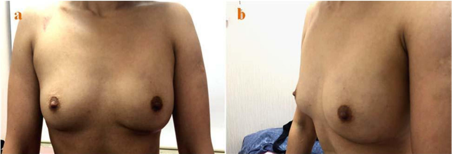
1D. Post-operative Image of the same patient after 1 year follow-up a, b) Post-operative images after 1 year of the surgery.