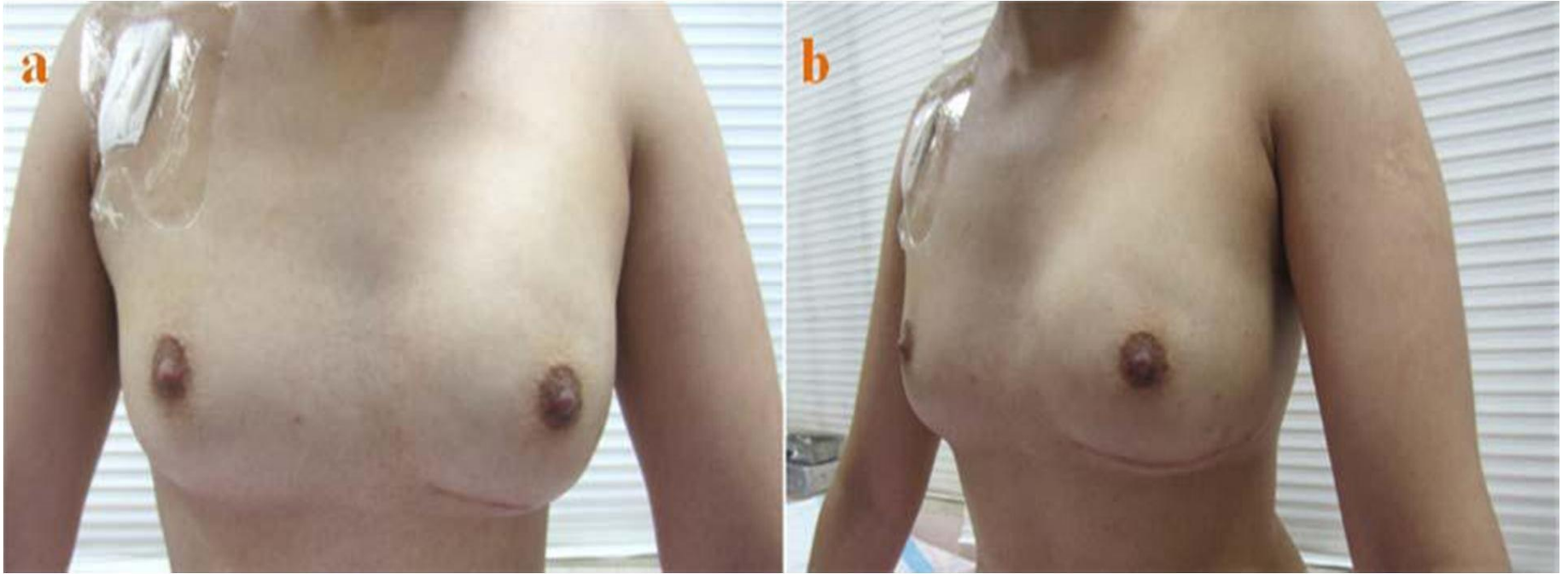
1C. Post-operative Image of the same patient after 3 months follow-up

a, b) Post-operative images after 3 months of the surgery and Lower pole fullness achieved.