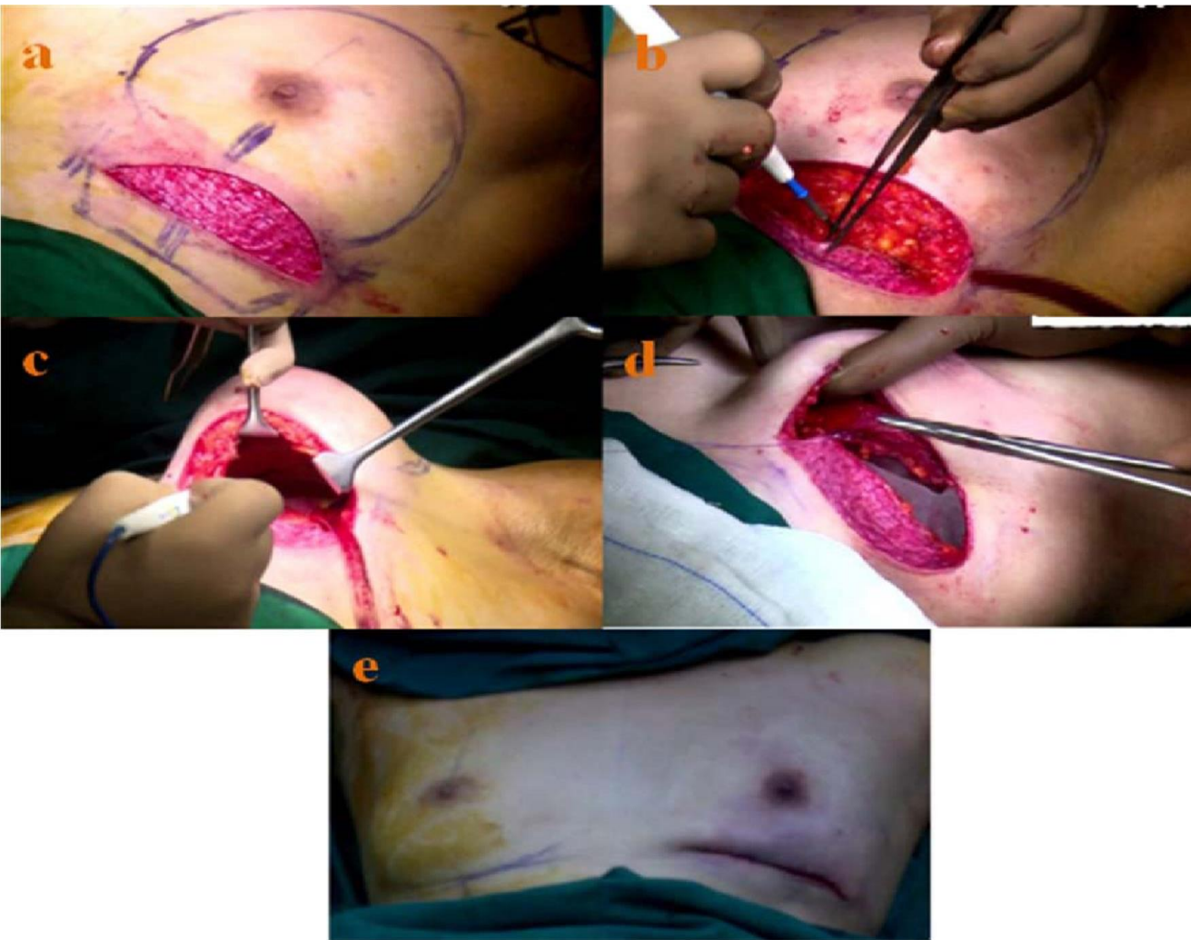
Figure 1: Representative Case Study for A-ALDS based IBRS