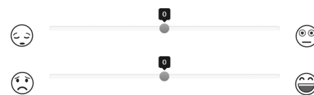
Fig. 1: Affective slider: Arousal (top): 'How "energised" do you feel right now?'; and Pleasure (bottom): 'How pleased do you feel at the moment?'

In order to support the clinical validity of the valence and arousal measures, we performed a Pearson's product-moment correlation between them and the HADS scores. Both were negatively and significantly correlated with HADS ( p < 0.01 ), with coefficients of -0.62 and -0.71 , respectively. Figure 2 represents this association. Hence, participants with higher scores on the HADS questionnaire reported lower levels in the affective slider. The prompt used to collect the affective scores is shown in Figure 1.