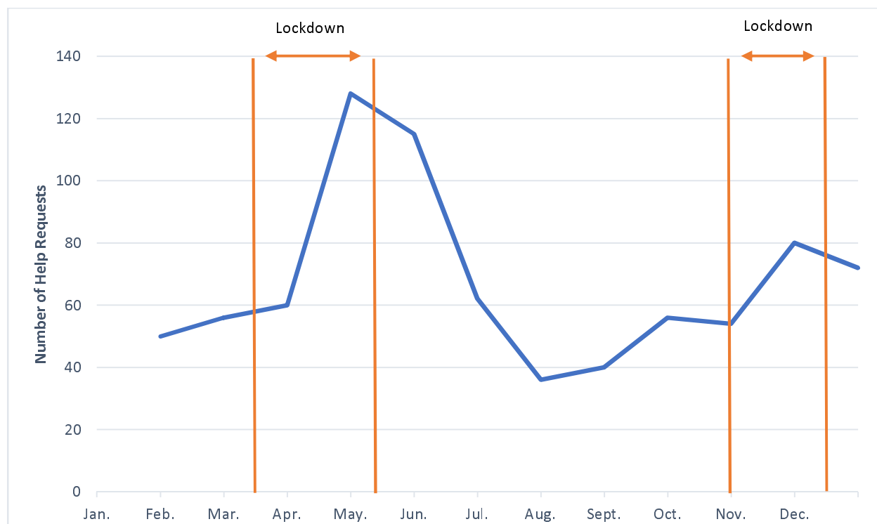
Figure 1: The Number of Telemedical Abortion Consultations from France received by Women on Web between 1 January and 31 December 2020 (n = 809).

Table 1 summarises background and pregnancy & abortion related experiences of women. Table 2 illustrates the reasons why women from France requested telemedicine abortion through WoW.