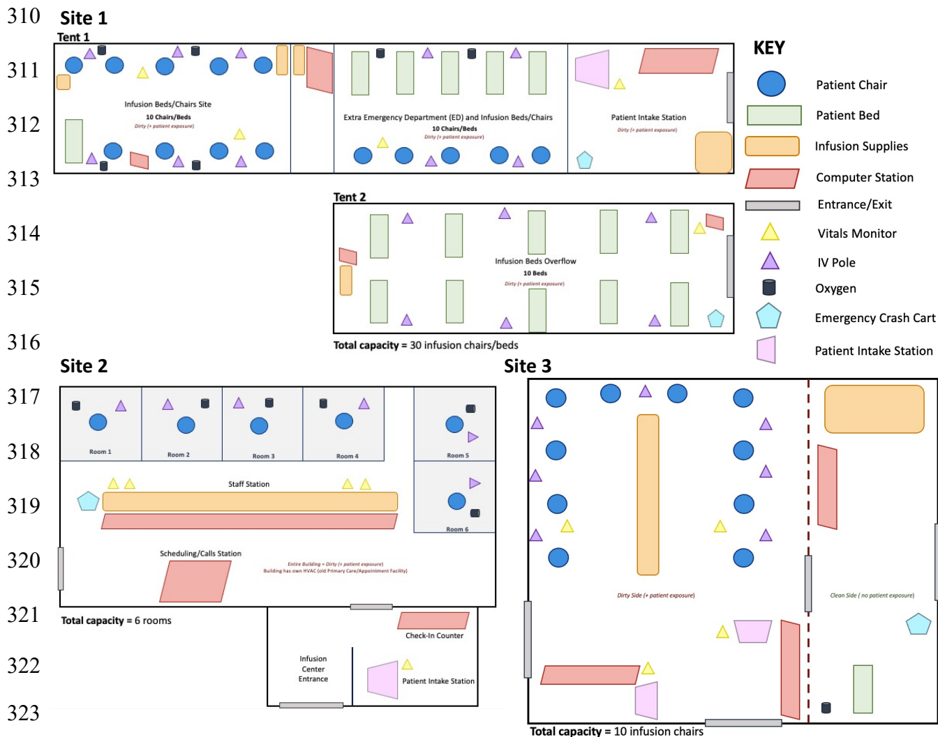
325 Figure 3. Monoclonal antibody infusion site physical environment schematics of Sites 1-3 indicating resources, site 326 type, and layout.