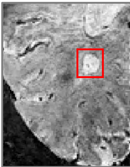
Figure 2. A paramagnetic hypointense rim lesion in relapsing-remitting multiple sclerosis identifying chronic inflammation, as visible on susceptibility weighted imaging.

Presence of rim lesions was established for participants with SWI images acquired at follow-up. Rim lesions (Figure 2) were defined as hyperintense lesions on FLAIR which also have a hyperintense core surrounded by a hypointense rim on SWI.