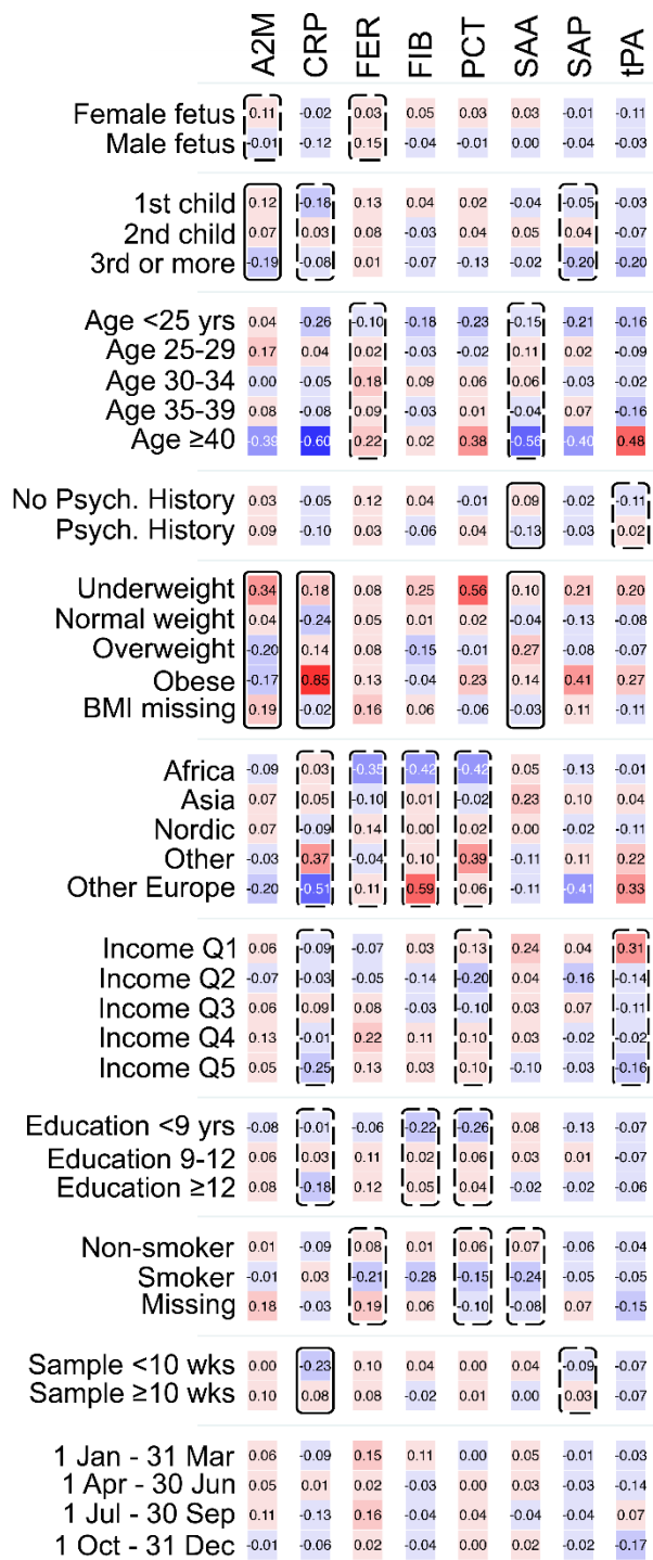
Figure 1. Heat map showing the mean APP z-score by categories of the covariates, among 429 unaffected individuals in the cohort. Solid boxes indicate that the APP is associated with the covariate at p < 0.05 . Dashed boxes indicate that the APP is associated with the covariate at p < 0.20 . Abbreviations: A2M : \alpha -2 macroglobulin; CRP : C-reactive protein; FER : ferritin; FIB : fibrinogen; PCT : procalcitonin; SAA : serum amyloid A; SAP : serum amyloid P; tPA : tissue plasminogen activator; Psych : Psychiatric; BMI : body mass index; Income Q : income quintile.