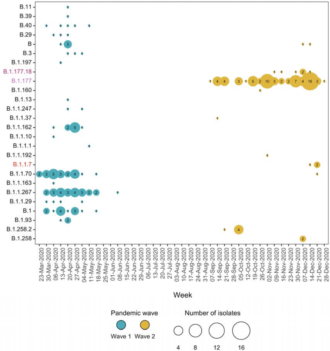
Figure 1: Pattern of SARS-CoV-2 genome lineage classification by week between March and December 2020