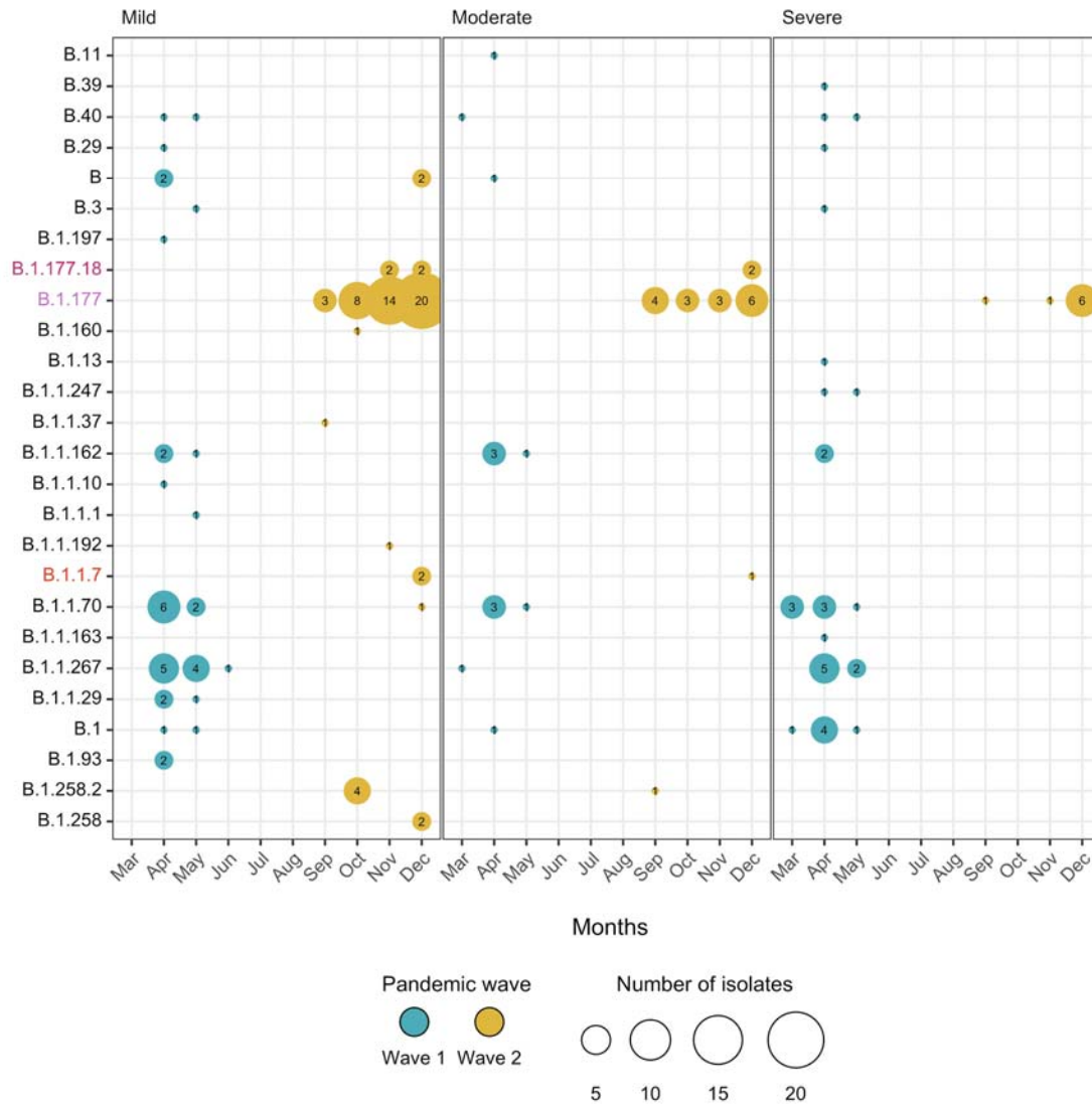
Figure 3: SARS-CoV-2 genome lineage classification by month and COVID-19 disease severity grade between March and December 2020

The size of the circle is proportional to the number of lineages detected.