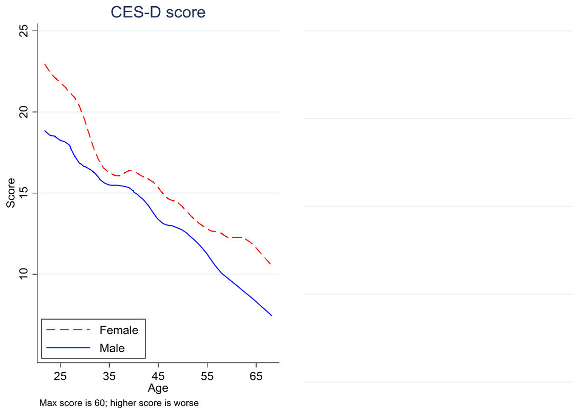
Figure 1. CES-D score and depression risks by age and gender