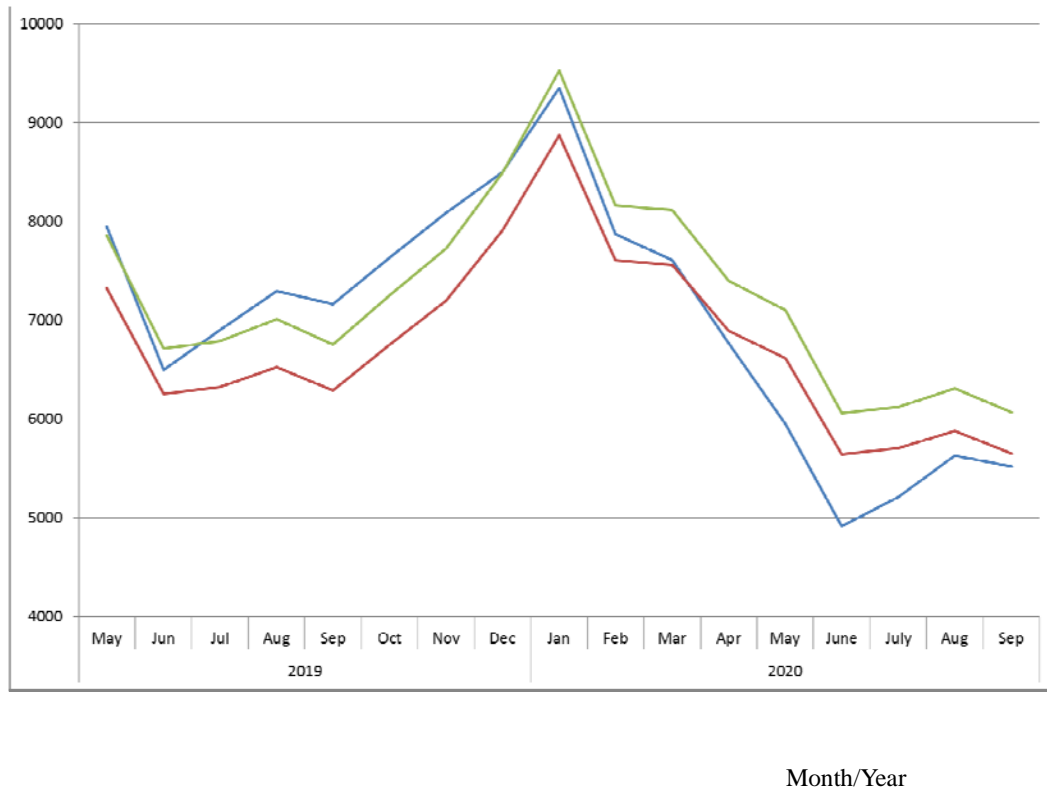
Figure 2: Observations of the estimated baseline and threshold for pneumonia deaths since May 2019 in Japan (persons)

Note: The blue line represents observations. The orange line represents the estimated baseline. The gray line shows its threshold.