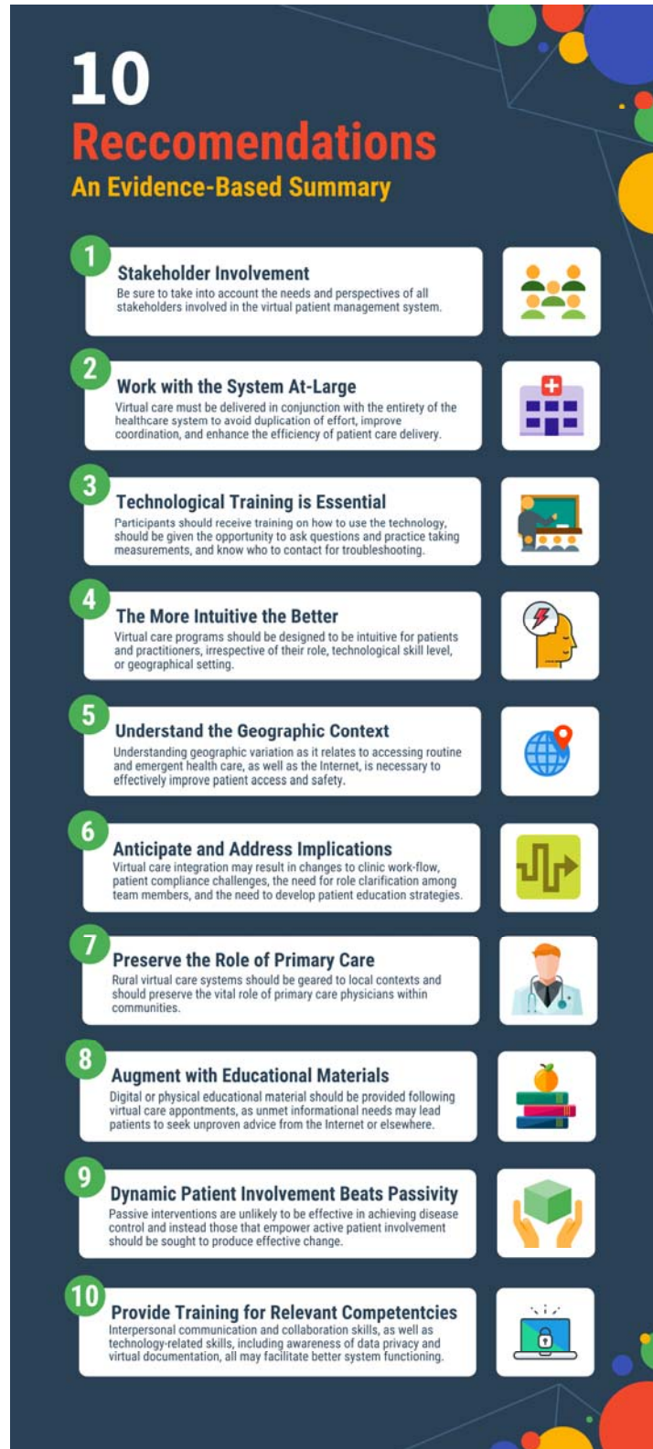
Figure 3. Summary of virtual care recommendations.