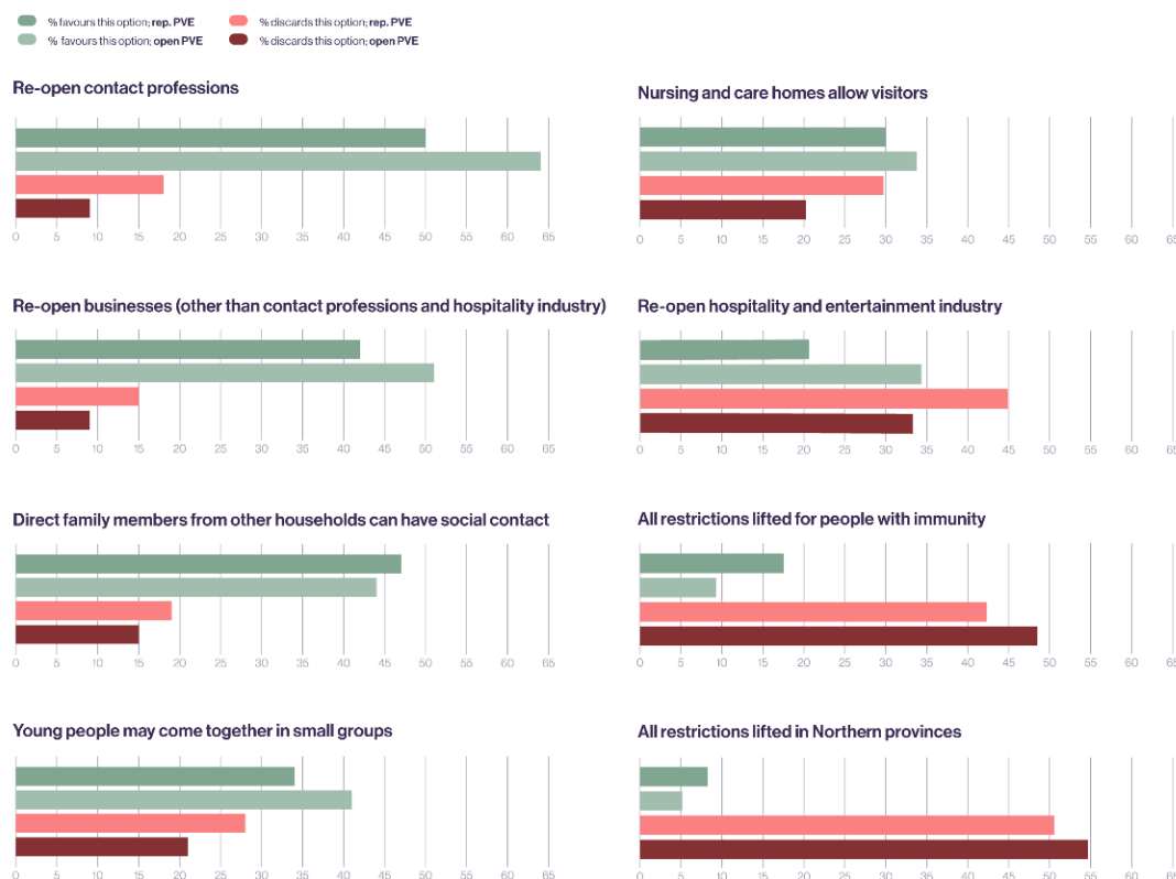
Figure 2: Percentage of respondents who recommended or opposed the eight relaxation measures

One area of broad agreement was opposition to the relaxation of restrictions for specific groups of citizens. In both the representative PVE and the open PVE, the option “All restrictions lifted in Northern provinces” was least often advised, with “All restrictions lifted for people with immunity” not far behind. As seen in Figure 2, both options were rejected by more than 45% of the participants in the open PVE.