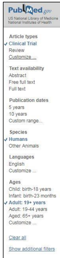
Figure 2. The PubMed ‘filter’ panel allows selection of a subset within a literature search.

For example ‘Article types’, ‘Species’ and ‘Ages’ all rely on fields added at the time of MeSH® indexing. If an article has not been MeSH® indexed it will be excluded from the search if these filters are applied.