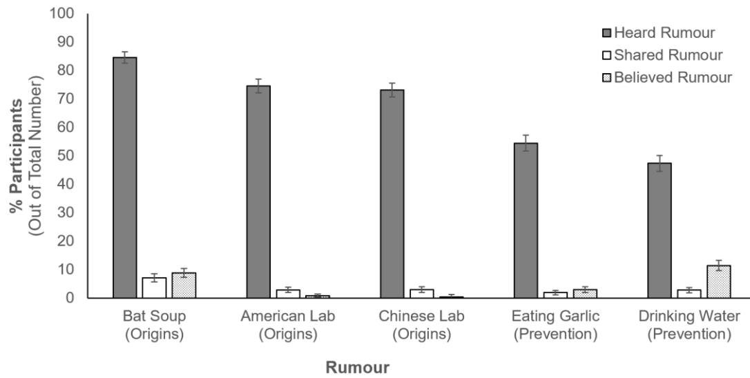
Figure 1: Proportion of participants hearing, sharing, and believe each COVID-19 rumor (that the virus originated from the consumption of bat soup, from an American lab, or from a Chinese lab; or that the virus can be cured by eating garlic or drinking water). Vertical lines represent the 95% confidence interval.