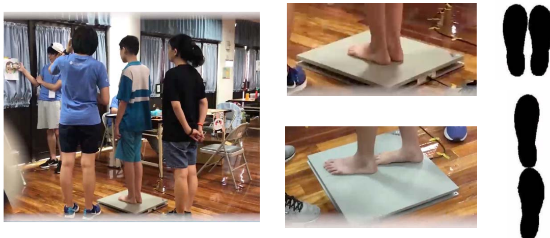
Figure 1. Measurement of postural sway while standing on a force platform for different conditions. Students were asked to fixate at a distant target at 3 m under open eye condition (left panel). Upper condition of the right panel was double-leg standing with feet together, while the lower condition was tandem stance.