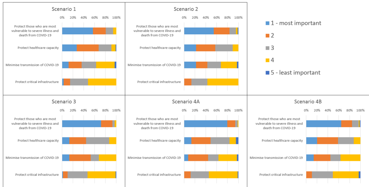
Figure 2. Stacked bar charts comparing the percentage of each ranking contributing to the total for COVID-19 pandemic immunisation strategies for different pandemic scenarios at the time of initial COVID-19 vaccine availability

Scenario 1: The pandemic is still in progress and sustained community-level COVID-19 outbreaks continue. Scenario 2: There is a possible new wave of the pandemic with COVID-19 activity rising again after a post-peak period. Scenario 3: The pandemic is in the post-peak period and COVID-19 activity remains low. Scenario 4A: The pandemic is considered over, but COVID-19 continues to circulate at low levels. There is evidence that the vaccine (or previous infection) provides long-term protection against COVID-19, but a routine vaccination program may be required for new cohorts that are immunologically naïve. Scenario 4B: The pandemic is considered over, but COVID-19 continues to circulate at low levels. There is evidence that the vaccine (or previous infection) does not provide long-term protection against COVID-19 and a routine vaccination program will be required for much of the population.