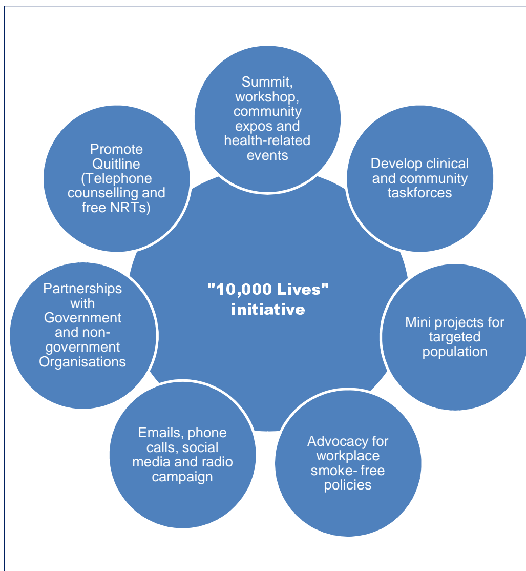
Figure 3. Major strategies employed by “10,000 Lives” initiative