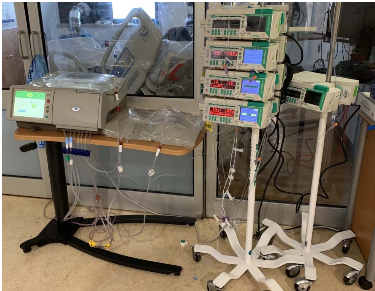
Figure 2: Placement of the cyclor outside the patient room in the ICU. Subsequently drain bags were also used obviating the need for a drain line. The room is retrofitted with high-efficiency particulate absorbing (HEPA) filters to accommodate airborne isolation.