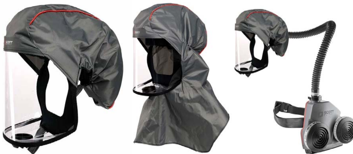
Figure 1. 3M Scott FH1 and FH2 Headtops and PAPR arrangement

The fidelity of the hood relies on the assumption that high flow forced air prevents the wearer from inhaling directly from the environment. This is also the rationale behind the supposition that users are unable to contaminate the internal spaces of the hood such as the tubing because it is felt the high air flow prevents any retrograde flow of exhaled air. Local guidance states that users should don the hood before turning on the fan unit. In addition, obstruction of the filter air inlet ceases airflow to the hood. This is of particular significance in the current pandemic since it is now well documented that individuals may be COVID-19 positive but asymptomatic, 10 thus putting other shared hood users at risk.