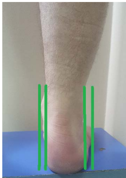
Figure 1: Assessment of the position of the forefoot relative to the back foot according to FPI-6